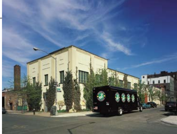
The brewery's trucks, emblazoned with the now-iconic logo by Milton Glaser, are a familiar sight around New York.