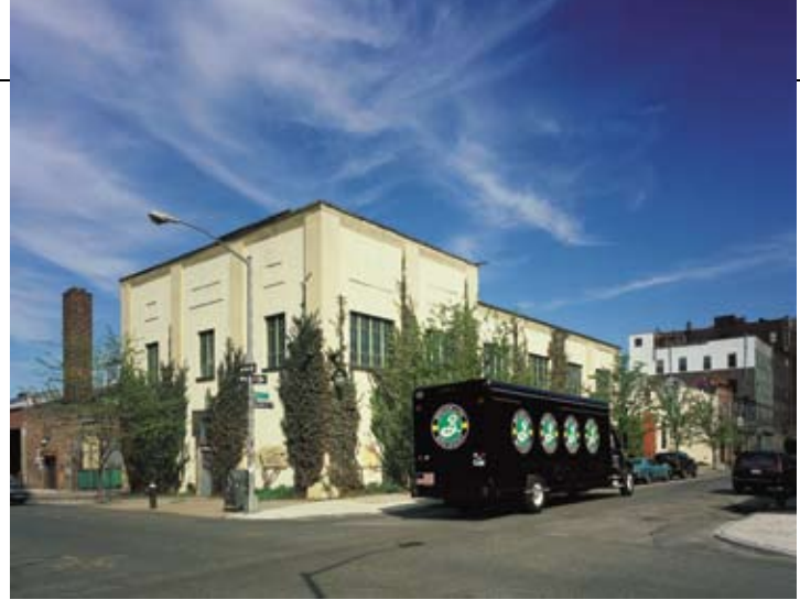
The brewery's trucks, emblazoned with the now-iconic logo by Milton Glaser, are a familiar sight around New York.